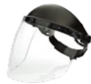
Complete head shield and head gear with clear visor Ref. 1652501